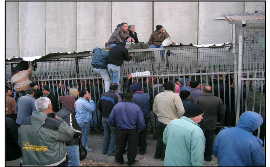
Trying to get to work in the morning

We arrived to do checkpoint monitoring at 4.45 a.m. It was still dark and very cold. Six hundred Palestinians were already waiting there. The queuing starts at 2.00 a.m., but the barriers do not open until 5.00 a.m. The Palestinians stand crushed together in a three foot wide tunnel that is sealed by wire. They bring blankets for warmth. They bring cardboard with them so they can kneel and pray on it, if they can find room. This cardboard doubles up as a source of heat when they burn it in little piles.