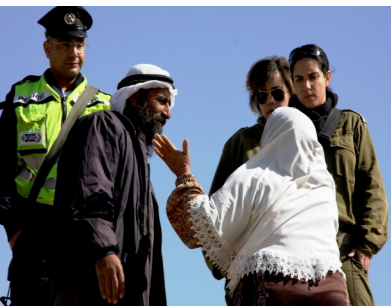
Pleading with the military police

There are approximately 6 trees planted by the time the military and the police have come closer to us. They call us over and start to tell us to leave the land. They state that the area is a closed military zone and that we have no right to be on it. The Palestinians argue that this is their land and that they have a right to farm it. The Palestinian women become very emotional and you can see the frustration that has built up in them. They are shouting, they take no pause or break in their talk, and their hands are gesticulating all over the place. Their faces are brown and creased with the sun.