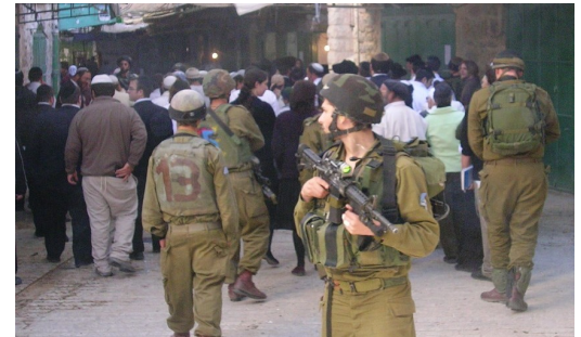
Israeli soldiers on patrol

Five hundred settlers are residing illegally in the city, contravening the 4 th Geneva Convention. They have the protection of 1,500 Israeli military and despite this illegal residency, 35- 40 Israeli Settlers on the Settler's Tour are surrounded by 18 gun pointing Israeli soldiers and the guns are pointed at the Palestinians and at the Internationals working in the area. (See photo attached)