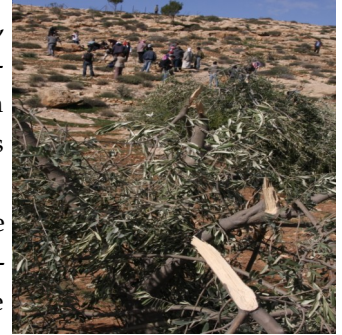
Destroyed olive trees

Five days previously, in the dead and darkness of the night of the 18 th January 2010, the Israelis living in the settlement on the top of the hill that looks down on At-Tuwani village and its farmlands, destroyed 20 olive trees. This has not been the first attack in the South Hebron Hills. Homes have been destroyed, poison has been spread on the lands, crops have been burnt and sheep have been shot.