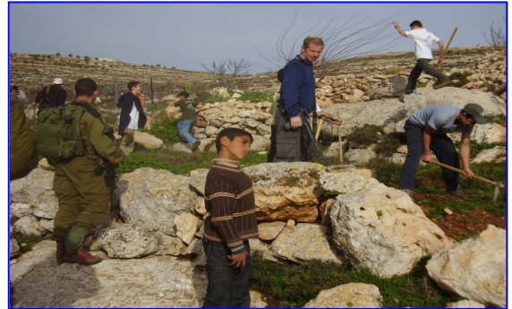
Young Palestinian boy watching what is happening.